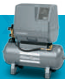
LFx Tank Mounted